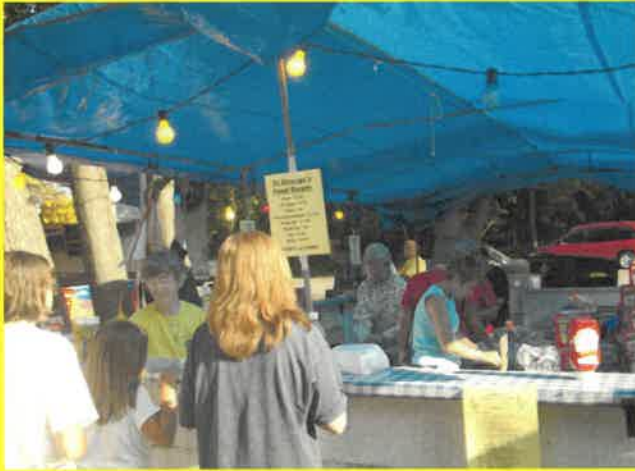
Brat Booth 2004