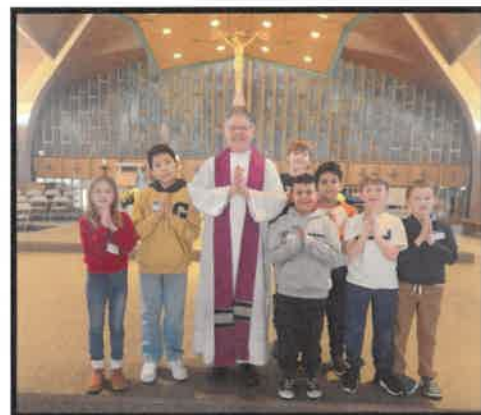
Top: Sacramental Sunday Cakes Bottom: First Reconciliation Retreat