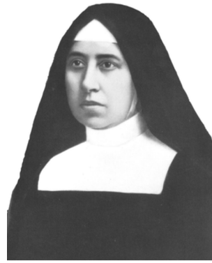
CC BY-SA 2.5; Santa Paolina.jpg